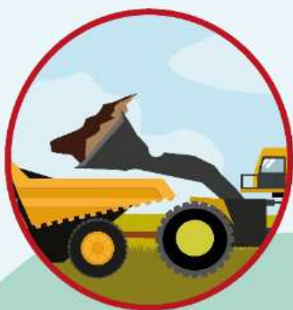
5. Coal extraction