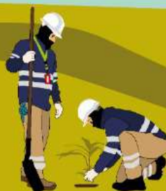
11. Reforestation of intervendid areas