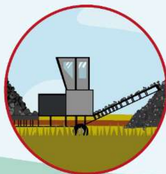
6. Coal crushing