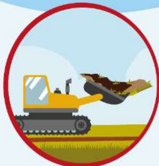
2. Recovery of the topsoil