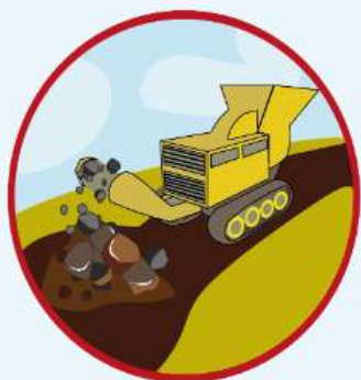
4. Removal of sterile material and construction of waste dumps