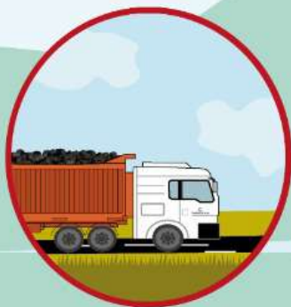
7. Charge and transporting coal in trucks