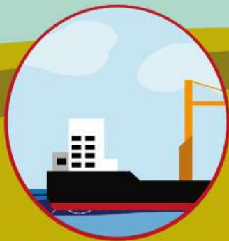
10. Coal transport by barge and ship charge trucks