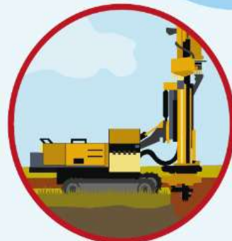
3. Drilling and Blasting