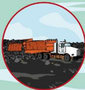
8. Discharging coal at the Shipping Terminal