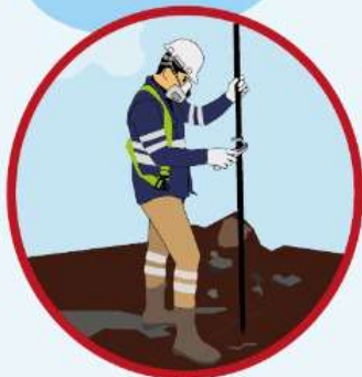
1. Exploration of the areas